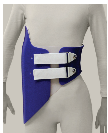
Providence® Thoracolumbar Curve Orthosis