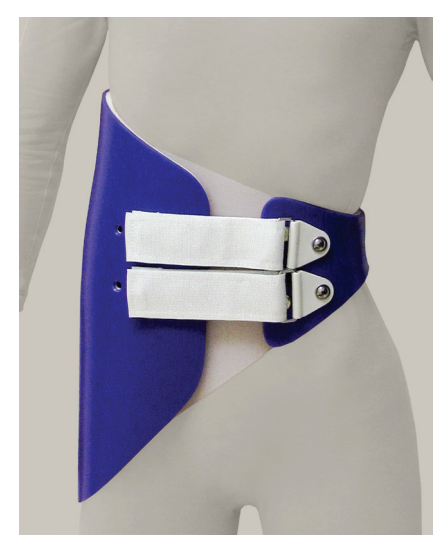
Providence® Lumbar Curve Orthosis